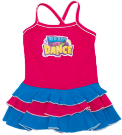
TUTU FRILL DRESS $50

All READY SET DANCE, READY SET BALLET, READY SET ACRO and READY SET MOVE students will be required to wear the official uniform that we are sure you will love. Below are the following options that can be purchased from Avenue D.