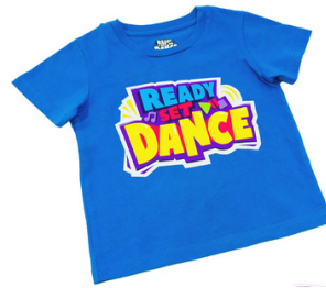
T SHIRT $25