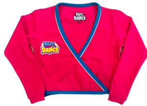
CROSS OVER $45