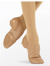
TAN JAZZ SHOES $40