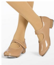
TAN TAP SHOES $45