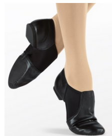
BLACK JAZZ SHOES $40