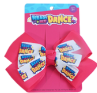
HAIR ACCESSORIES $8