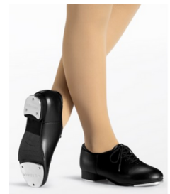
BLACK TAP SHOES $45