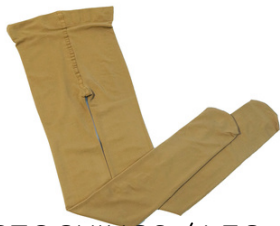
STOCKINGS / LEG WARMERS $12