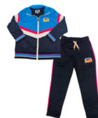
UNISEX TRACKSUIT $80