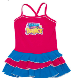
TUTU FRILL DRESS $55

All READY SET DANCE, READY SET BALLET, READY SET ACRO and READY SET MOVE students will be required to wear the official uniform that we are sure you will love. Below are some of the options that can be purchased from Avenue D. Jackets are available individually for $65 and trackpants for $35.