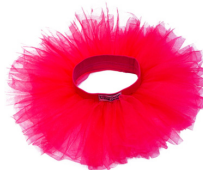
TULLE TUTU $20