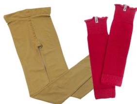
STOCKINGS / LEG WARMERS - $15