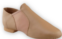
TAN (GIRLS) OR BLACK (BOYS) JAZZ SHOES - $50