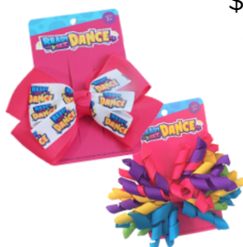
HAIR ACCESSORIES $8