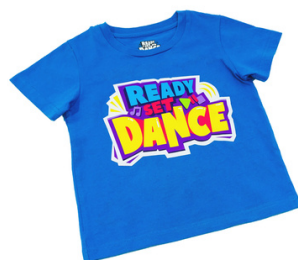
T SHIRT $25