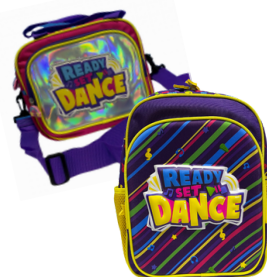
BACKPACK or CROSS BODY BAG - $35